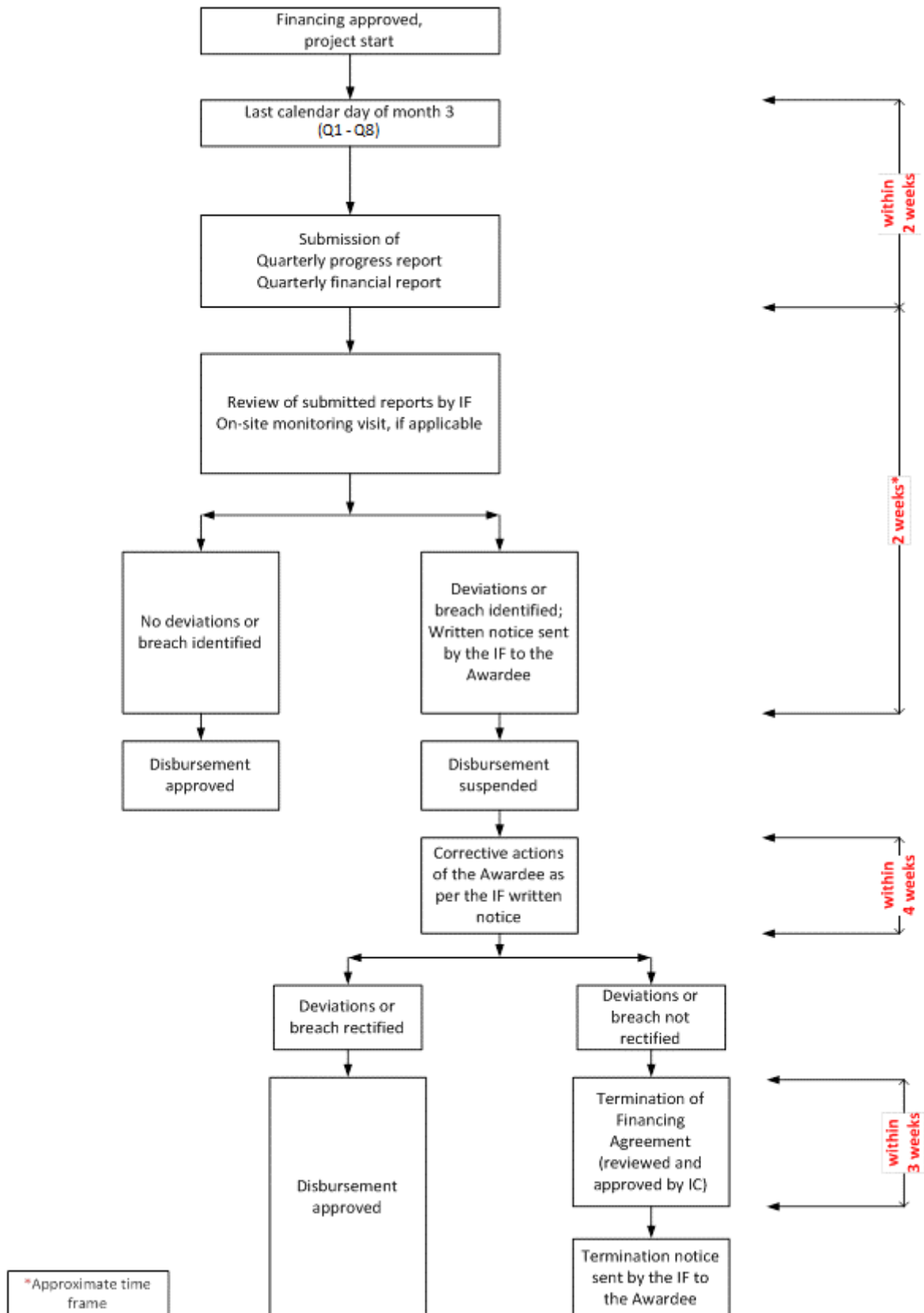
Figure 2: Monitoring procedure